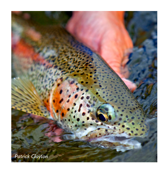
When you include WSC in your estate plans, you're making a permanent investment in the protection of healthy wild salmon rivers.

Across the North Pacific, around 19 watersheds represent our best chance at sustaining robust populations of wild salmon, steelhead, and trout. These "strongholds" for wild fish include remarkable river systems like Bristol Bay in Alaska, the Skeena and Dean in British Columbia, Russia's Kamchatka Peninsula, and the coastal river systems of Washington and Oregon, including the Hoh and Nehalem.